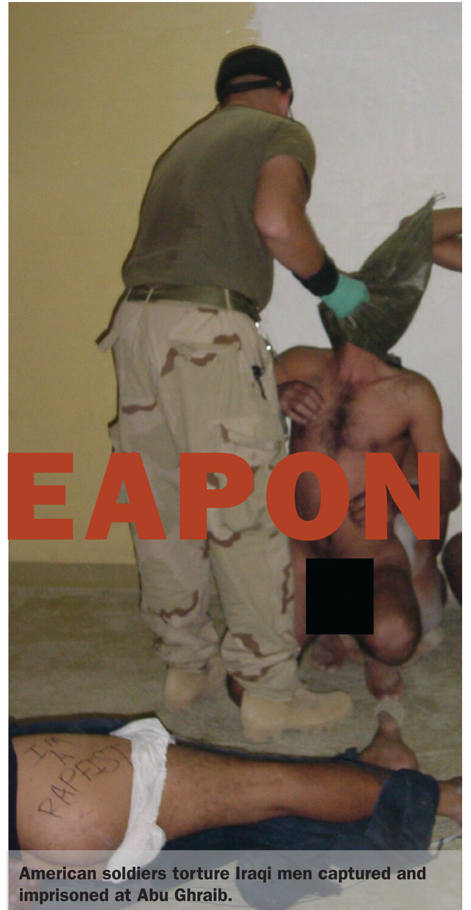
American soldiers torture Iraqi men captured and imprisoned at Abu Ghraib.